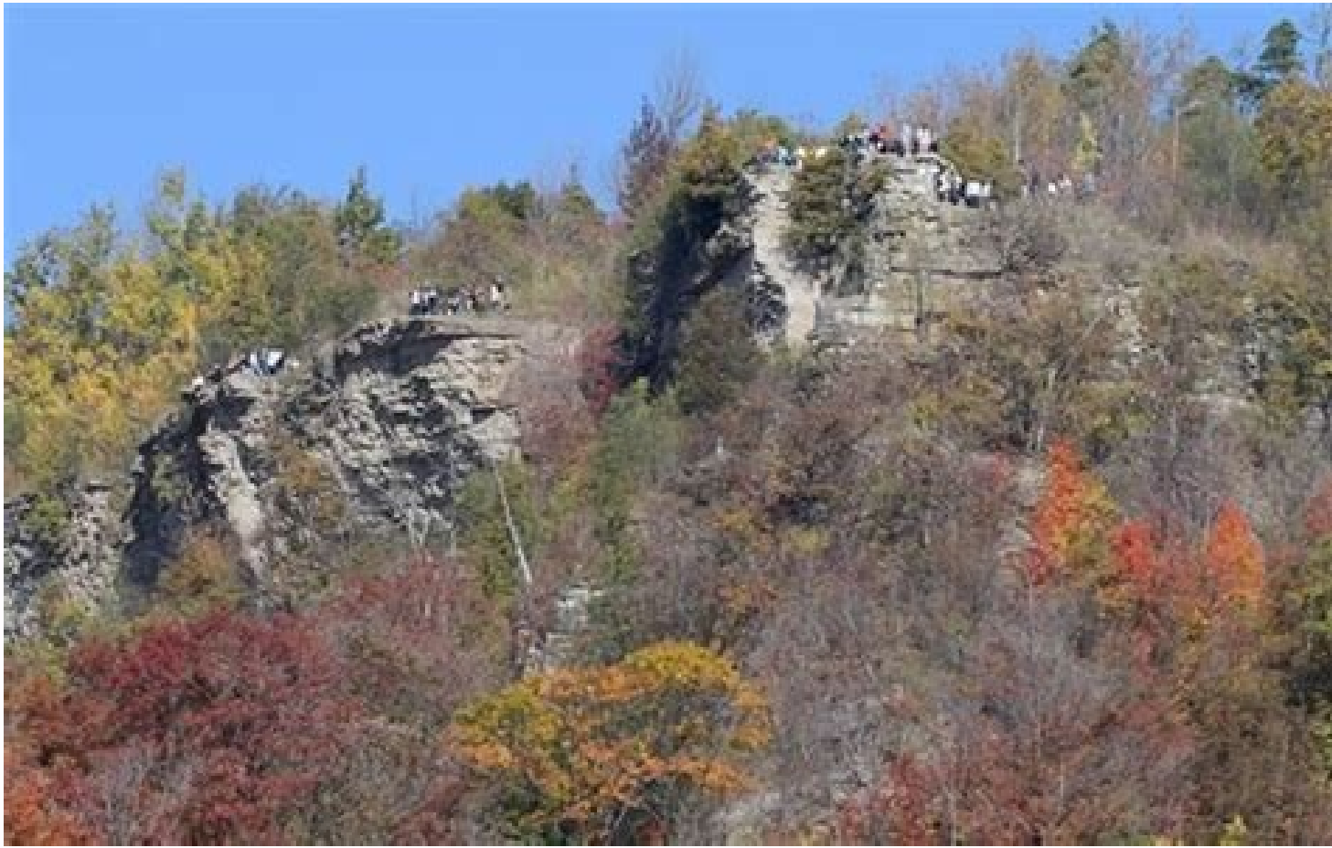
Dundas peak fall colour report.